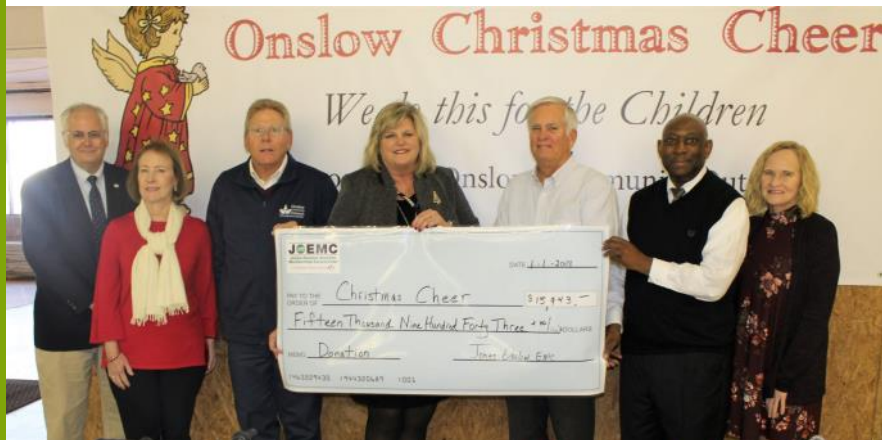
Jones Onslow EMC employees donate to Christmas Cheer.