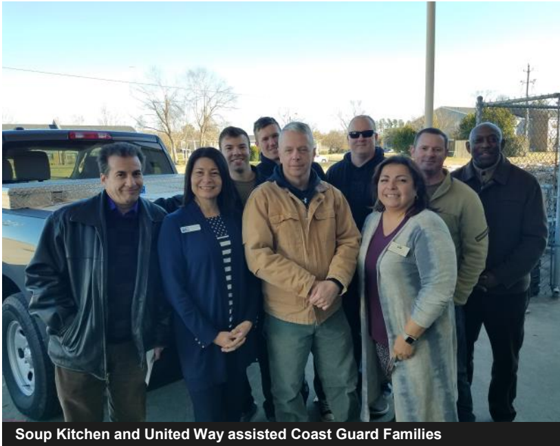
Soup Kitchen and United Way assisted Coast Guard Families