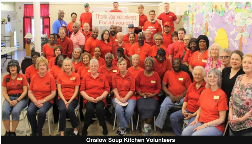
Onslow Soup Kitchen Volunteers