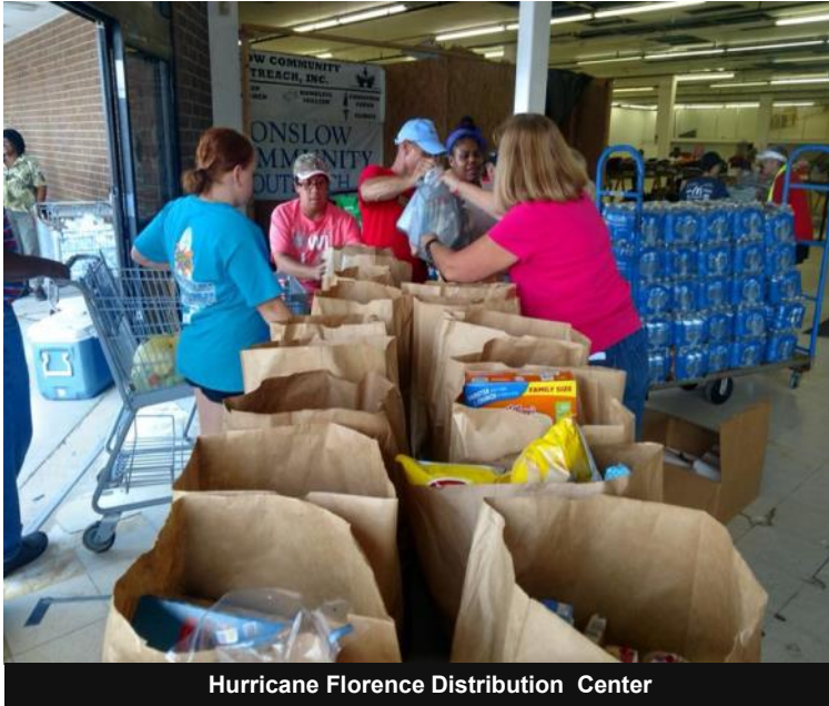
Hurricane Florence Distribution Center