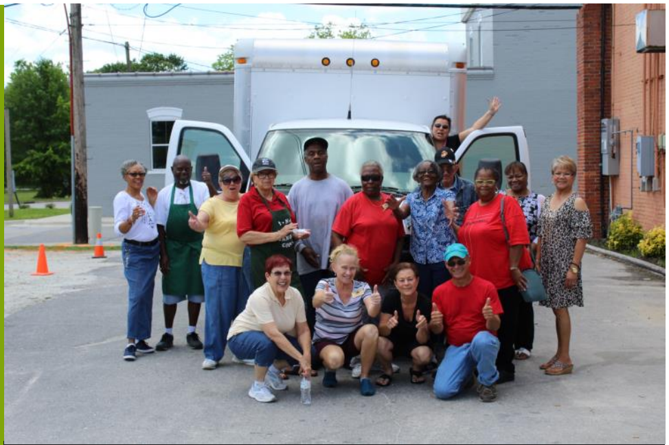
Soup Kitchen Volunteers raise money for new truck.

The appropriation was initiated by Sen. Harry Brown and supported by the Onslow County legislative delegation.